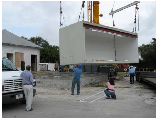
The Archives Bunker

How would the Society safely store archives in the restored frame house? A pre-cast concrete and steel "bunker" was delivered to form the inner walls of a fire and hurricane-proof archival storage facility (The structure is rated to withstand Category 5 hurricane winds.) The storage room is attached to Hunt House by a rear hallway. The 550 square foot room has been furnished with a dense storage system. Temperature, humidity and light will be controlled and set to museum standards. A permanent generator is to be a part of a back-up disaster plan.