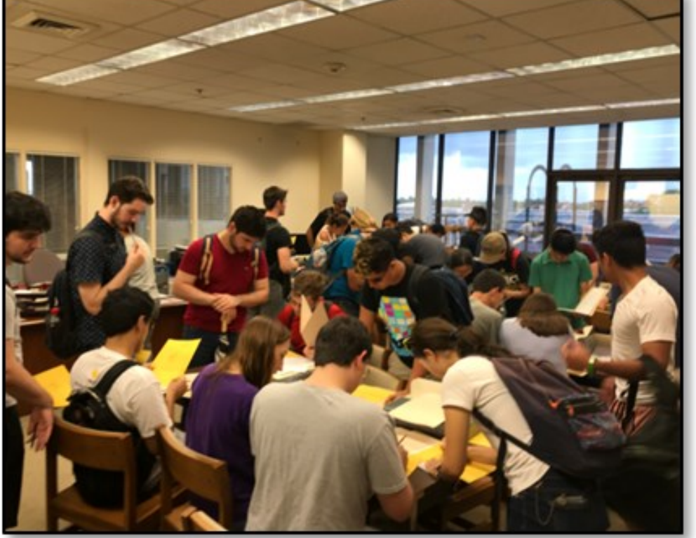
Escape the Library students in SCUA

For the second clue, we wanted to introduce them to Special Collections & University Archives (SCUA). We created a fake collection of newsletters that answered the crossword puzzle (created in Microsoft Excel) that they were given when they entered SCUA. While the collection was fake, the newsletters were copies of real newsletters. We had to create multiple copies of the same fake collection to accommodate the numbers we were expecting. If they filled in the crossword correctly, they'd end up at the LibTech Desk.