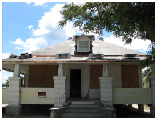
The Hunt House before construction, above, June 17, and after, below, October 3, 2008.

its third building. Hunt House was essentially a farm house in the beginning, a typical Florida bungalow with a high pitched roof and wide porches on the front and one side. It has now been restored to resemble a house of the