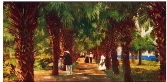
"Strolling in a perfect paradise" at the Henry B. Plant Museum

The Henry B. Plant Museum presents Strolling in a Perfect Paradise through Dec. 31. In October, photographers can enter their best photograph of Plant Park (the former garden spot of the Tampa Bay Hotel) in the Page Photography Contest. The top prize is $250 and a $250 contribution to the Henry B. Plant Museum in the winner's name. The winner's photograph will be on display during the Victorian Christmas Stroll . The top ten finalists will have their photographs displayed on the Museum's website, www.plantmuseum.com , and Facebook page.